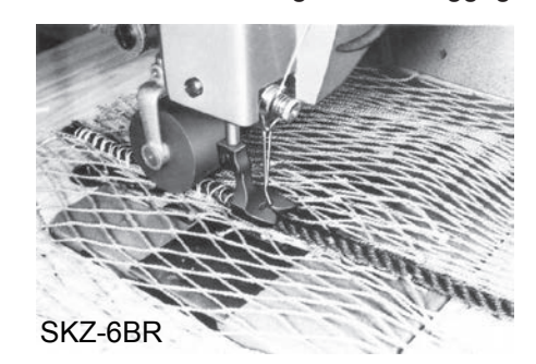
*Suit for repairing fishing net Puller performs exact stitching, by fixing flexible materials, thus suitable for sewing and repairing vinyl made fishing net, etc.